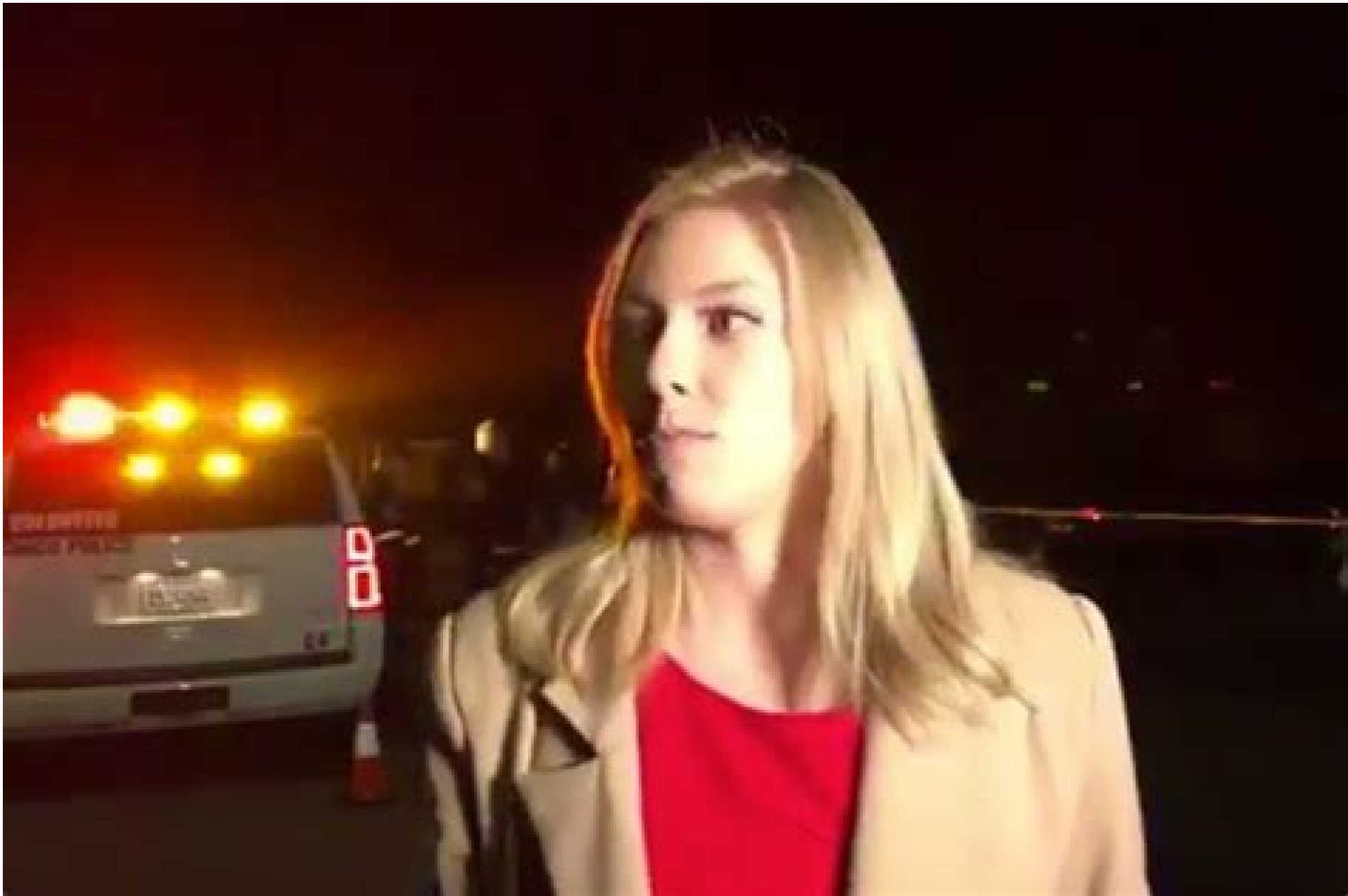
Sacramento news and review reporters. Cbs sacramento news reporters. Sacramento news and review closing. Sacramento news and review jobs. Fox 40 news sacramento reporters.